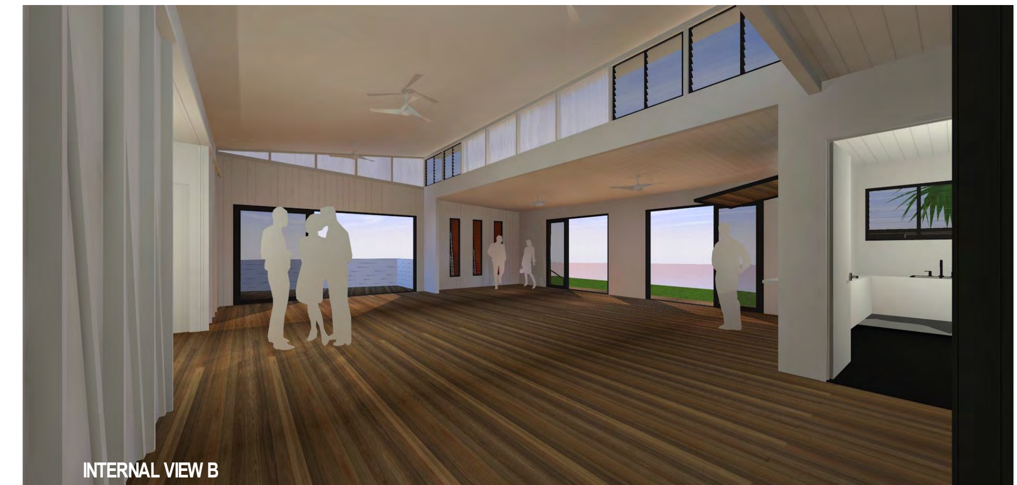
INTERNAL VIEW B

TIMBER FLOOR BOARDS OVER STRUCTURAL PLYWOOD PANEL.