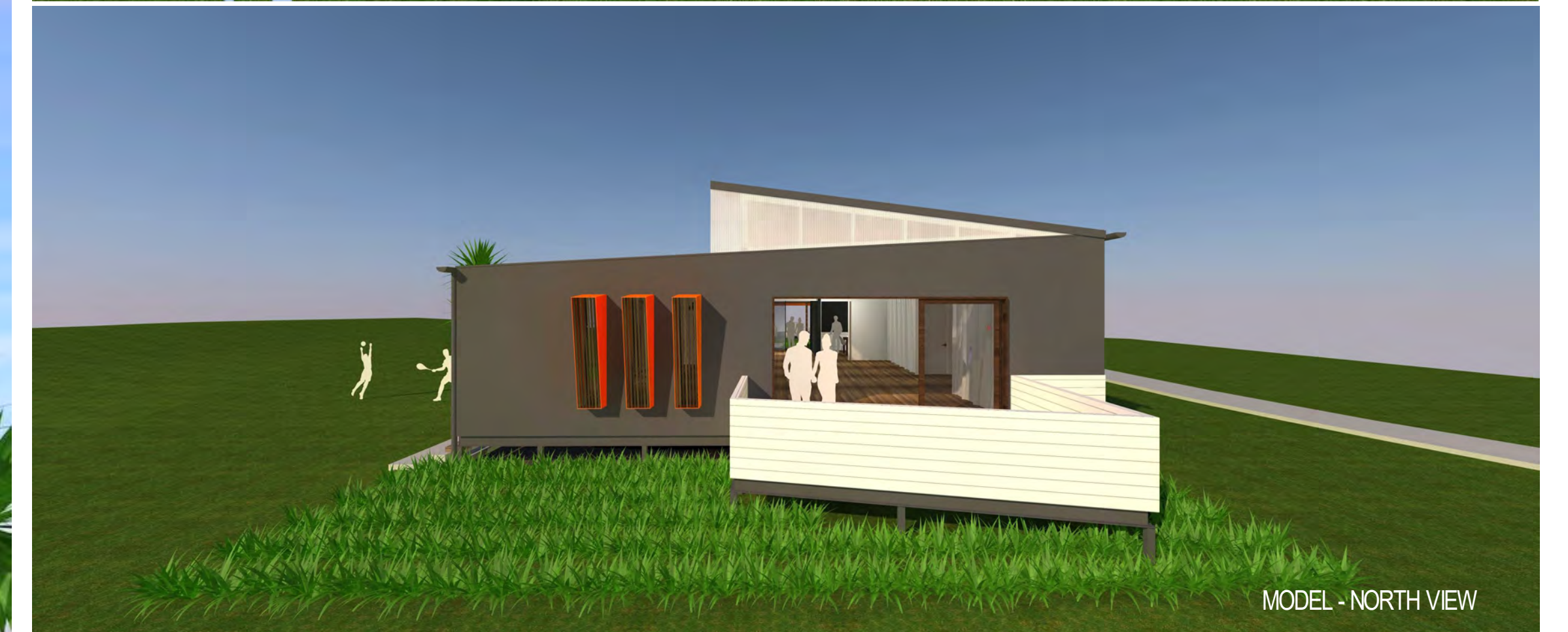
MODEL - NORTH VIEW

MOUNDED EARTH ENTRY RISE. LANDSCAPING TO BE CONFIRMED