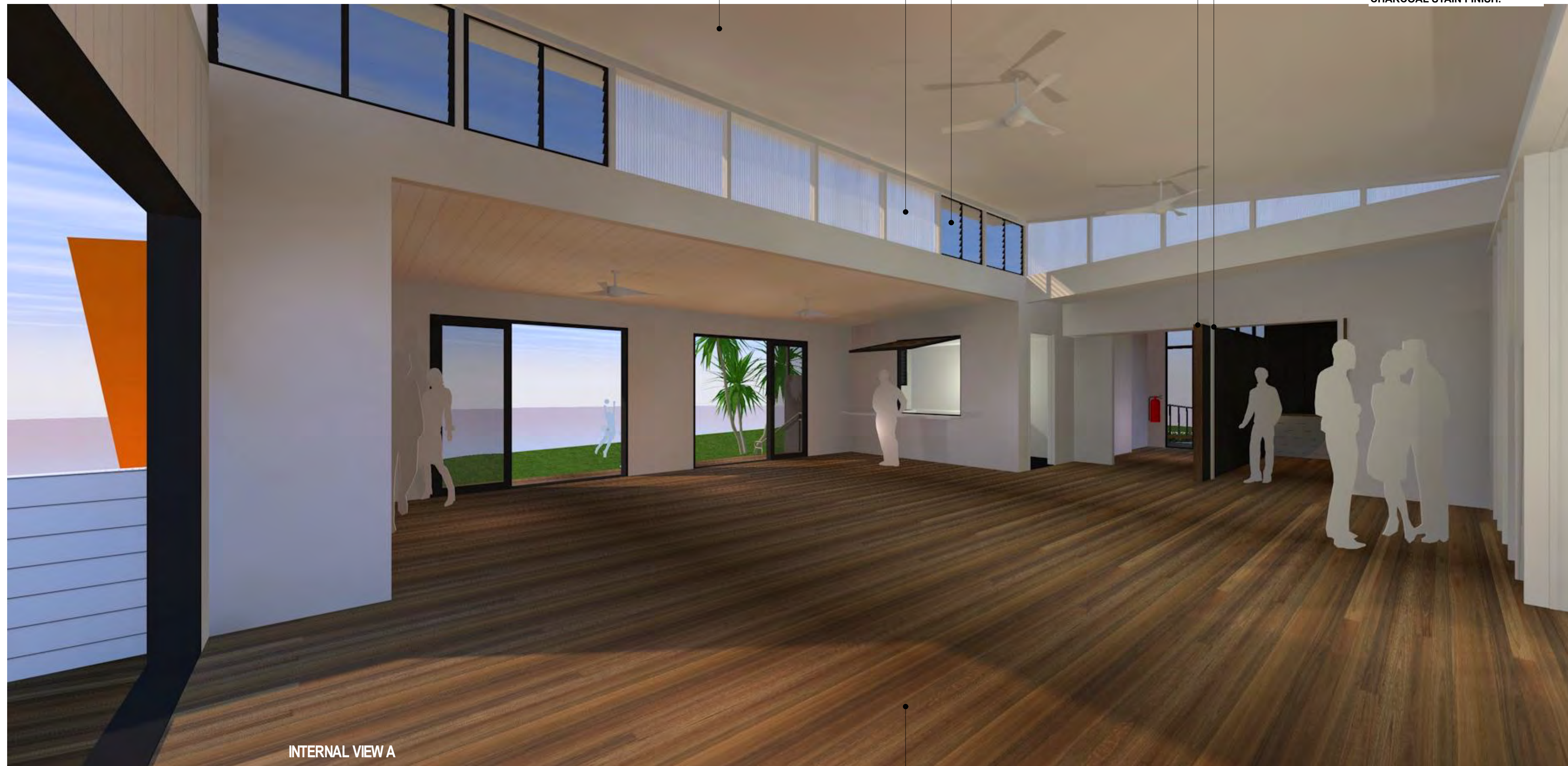
INTERNAL VIEW A

TIMBER LINING TO END OF WALL. WEATHERTEX WEATHERGROOVE NATURAL 75. CHARCOAL STAIN FINISH.