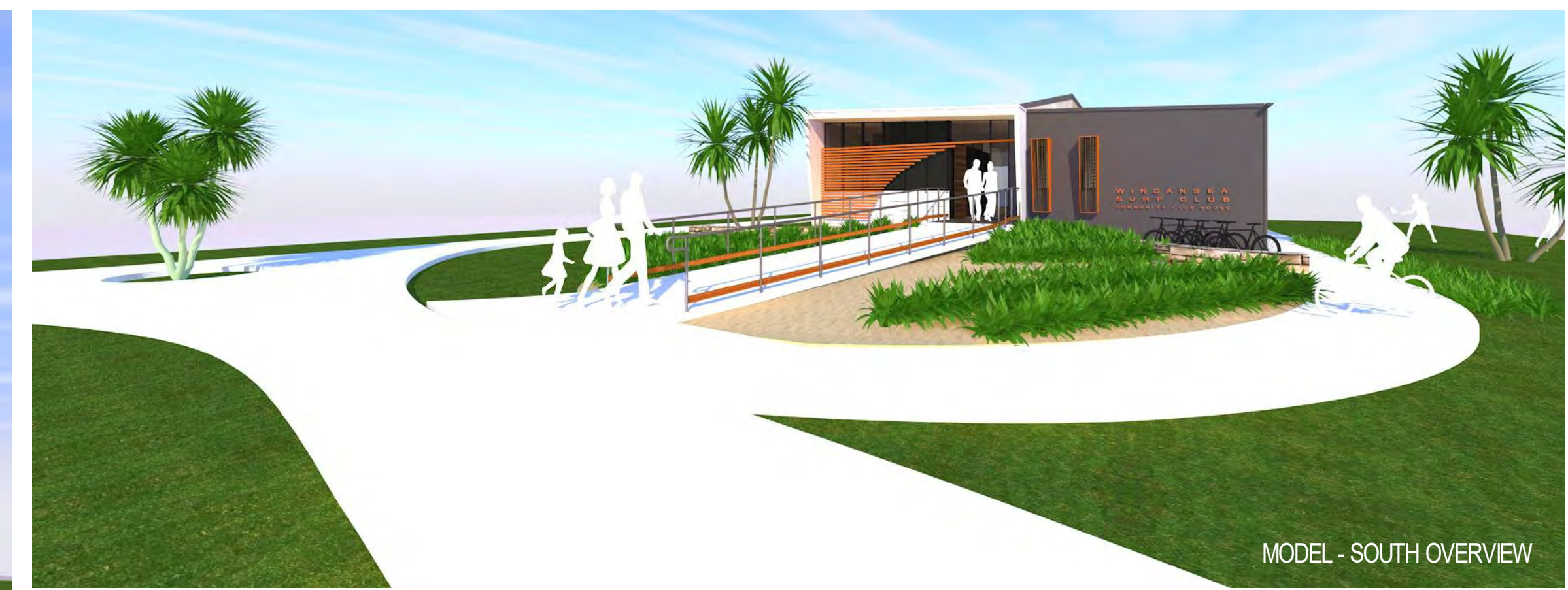
MODEL - SOUTH OVERVIEW