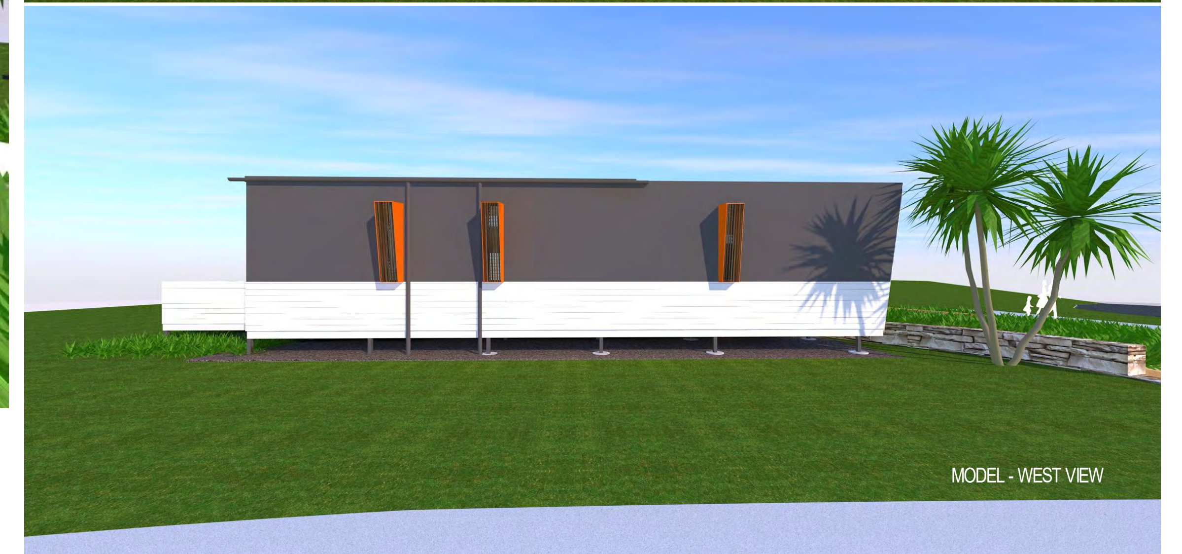
MODEL - WEST VIEW