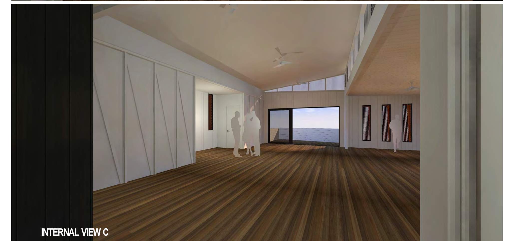
INTERNAL VIEW C