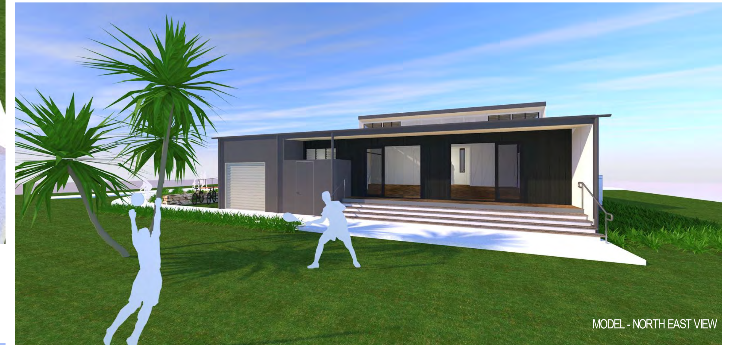
MODEL - NORTH EAST VIEW

WEATHERTEX WEATHERGROOVE NATURAL 75. CHARCOAL STAIN FINISH.