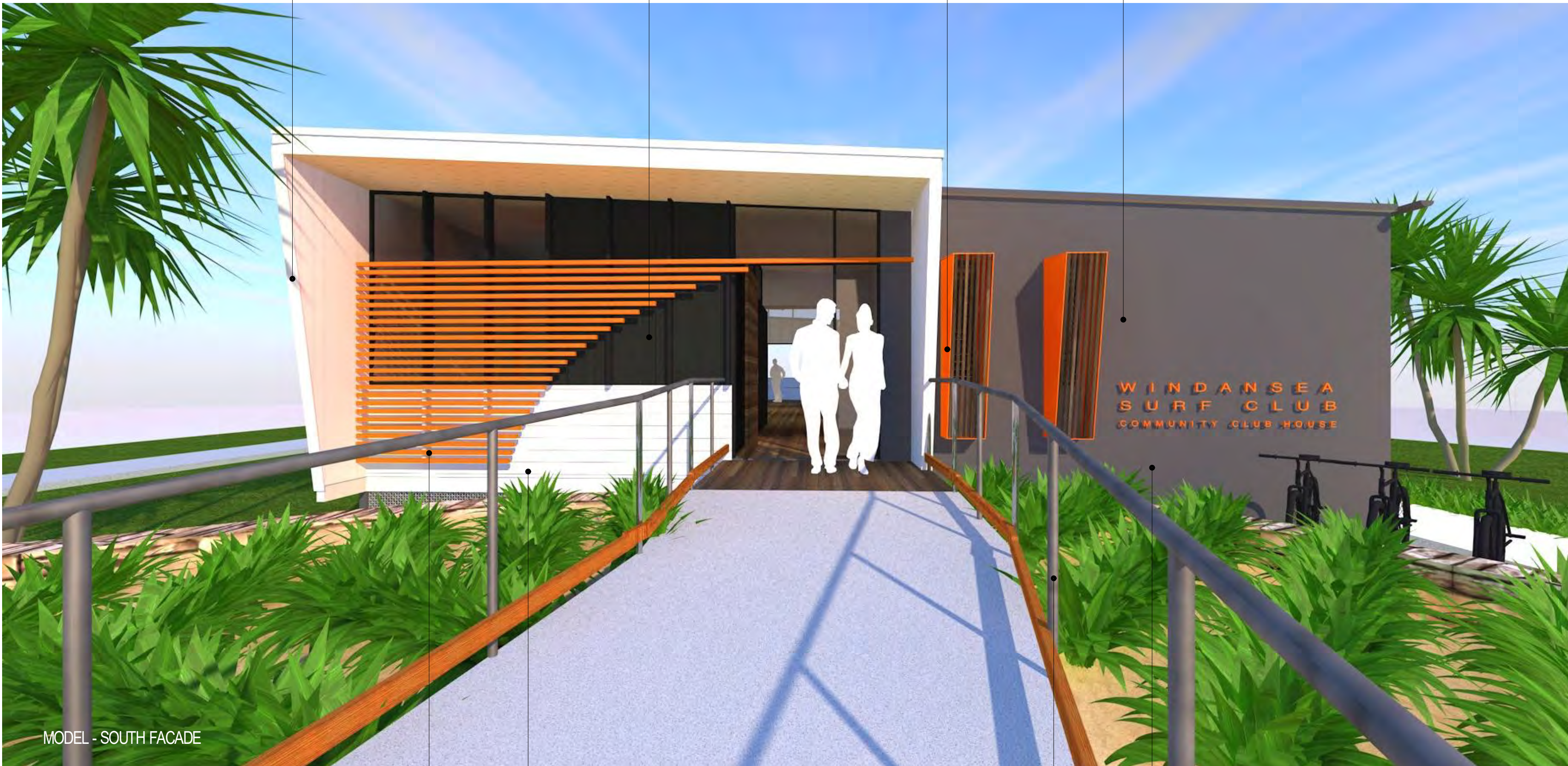
MODEL - SOUTH FACADE

JH EASYLAP 900 CLADDING. 8.5MM TEXTURE PAINT FINISH DULUX WIND SPRAY